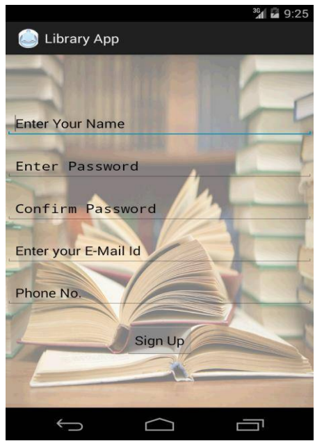
Fig. 2 Signup module