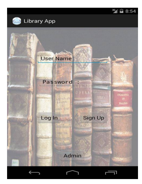
Fig .1 Login module

The Login module is for the user who had already signed up. The login module is mainly added for an authentication purpose if the user enters the wrong details he would not be allowed to enter the application. The login is broadly classified into two types User login and Admin login.