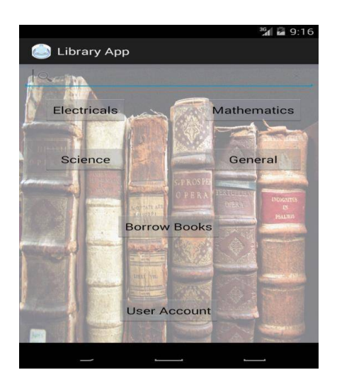
Fig. 3 User module

Once if the user enters the User name and password in the login module if the authentication is successful he will be redirected to the user module where he can search the books available in the library or he can choose the books in the category available. After selecting the books he can click the button called borrow books in order to borrow it.